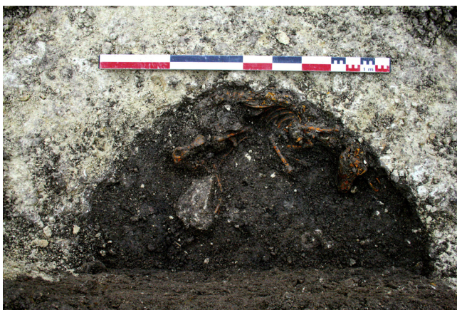
Fig. 2. Dog skeleton inside the excavated storage pit.