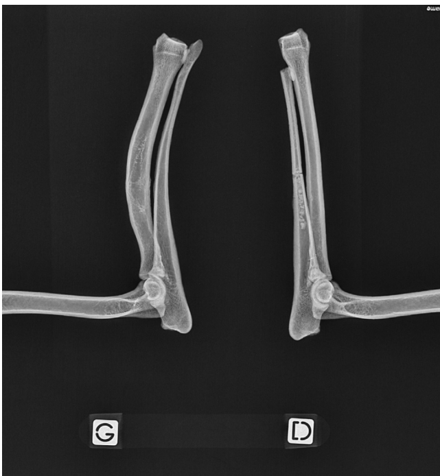
Fig. 8. Radiographic image of both antebrachium, medial view (G, left; D, right).

explain the limited shortening of the diseased forearm compared to the opposite limb and the animal's perfectly sound elbow joint.