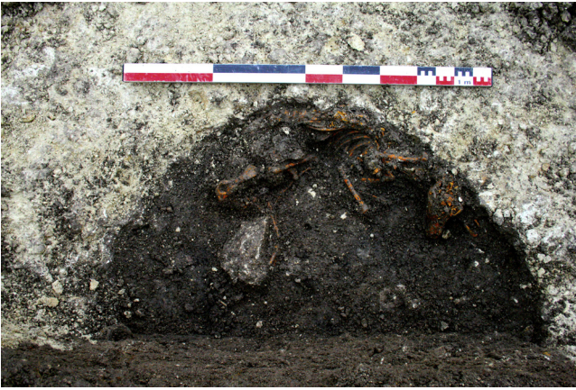
Fig. 2. Dog skeleton inside the excavated storage pit.