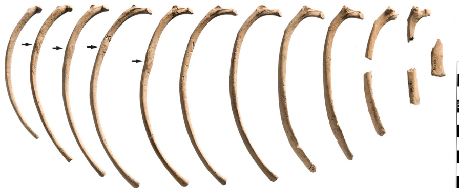
Fig. 4. Right rib cage, fractures of ribs 8–11, lateral view.

The dog's left radius appears bowed, displaying a marked medio-cranial convexity (Figs. 6 and 7) associated with a slight external rotation and deviation of its distal end. The curvature is regular, and except for a small portion of ossified interosseous membrane, the cortical bone appears smooth and even, in all respects similar to the unaffected contralateral bone. Both proximal and distal articular surfaces are normal, and no joint osteoarthritis is noted. The left radius, due to its curve, presents a shorter GL (Von den Driesch, 1976) than the contralateral bone (145.2 mm compared with 149.2 mm). The associated ulna also appears slightly curved in a cranial direction, but to a considerably lesser extent, and it displays otherwise no pathological modifications. Its length can