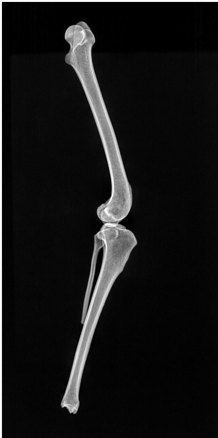
Fig. 11. Radiographic image of right stifle joint, lateral view.

Medial patellar dislocations are the most common orthopedic complaint in present-day dogs (Pucheu et al., 2003) and are in