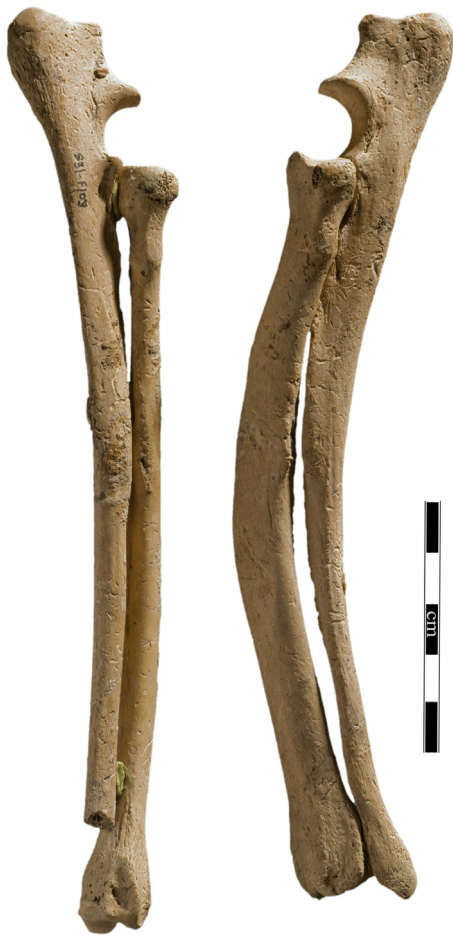
Fig. 7. Comparison of right and left radius-ulna, lateral view.