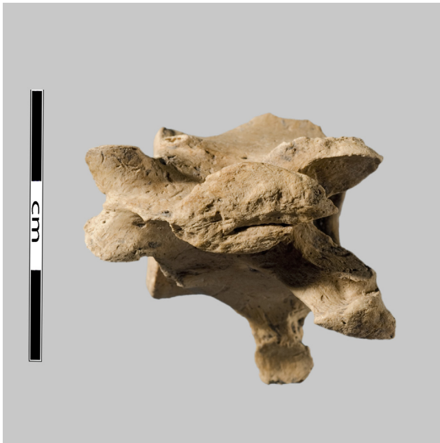
Fig. 5. Lumbar vertebra displaying anomalous spinous process, dorsal view.