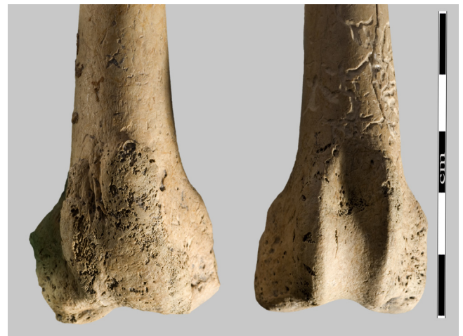
Fig. 9. Femur, trochlear groove, cranial view, pathological articular surface (left in picture) in comparison to contralateral limb.

The femoral lesions and especially the absence of a trochlear groove are evidence of a patellar luxation, presumably grade III or over, based on trochlear morphology (Nunamaker, 1985; Pucheu et al., 2003). The tibial lesions then indicate the direction of the dislocation. Indeed, the patella is included in the tendon of the