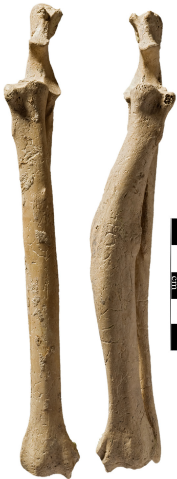
Fig. 6. Comparison of right and left radius-ulna, cranial view.

unfortunately not be compared to the opposite bone, the latter being fragmentary.