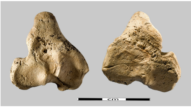
Fig. 10. Tibial plateau, proximal view, pathological articular surface (right in picture) in comparison to contralateral limb.

quadriceps femoris, tendon that inserts itself distally on the tibial crest. Any horizontal displacement of the kneecap, such as in patellar luxation, implies a displacement of the tendon and thus of the tibial crest, and thereby a rotation of the tibia on its greater axis. If weight is still borne on the injured limb, the articular surfaces of the tibial plateau will then be gradually remodeled in response to the new contact areas with the femoral condyles. In the present case, the animal exhibits a cranial displacement of the medial surface and a caudal displacement of the lateral surface, which signify an internal rotation of the tibial crest, typical of a medial patellar luxation.