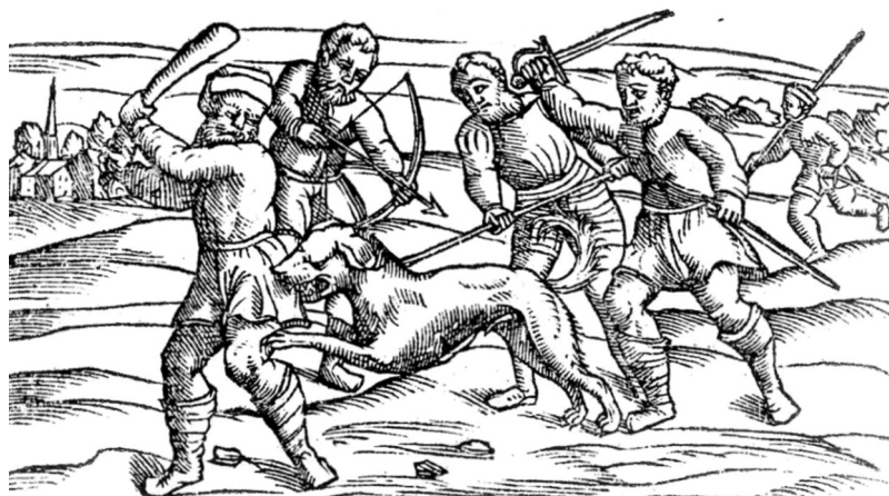
Fig. 12. Killing of a rabid dog, woodcut engraving, 1575, spanish edition of De materia medica by Dioscorides.

What is surprising, on the other hand, is the lack of data on animal abuse in the archeological record. Our bibliographical researches unearthed no comparable published cases for medieval France, and only one for medieval Europe, a partial dog skeleton from Kilkenny (Ireland), which displayed evidence of fractures on several thoracic vertebra and on four ribs, two right and two left (Murphy, 2005). All fractures were in an early state of healing at