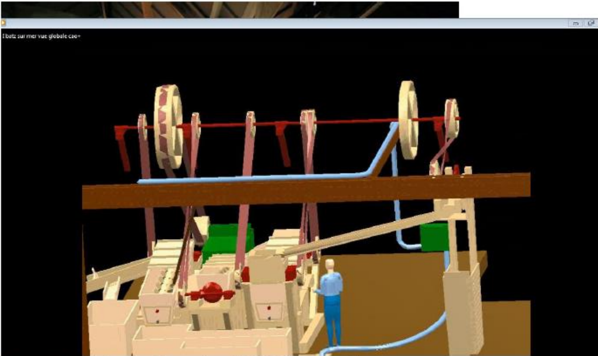
Batz-sur-Mer Salt Laundry, Screen shoot 3D CAD Florent Laroche.