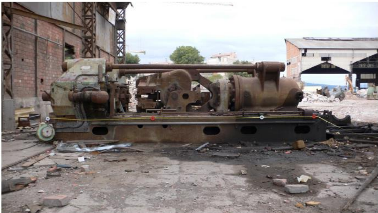
La Ciotat Bennie bending machine

Today, in the large difference of ten years ago where the closure memory was still painful, it is clearly possible to speak in the city about the shipyards past and story 25 . In 2011, a public conference we did showing the video was really a success.