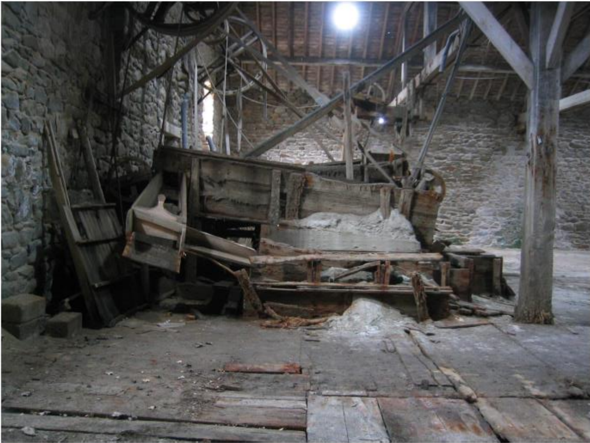
Batz-sur-Mer Salt Laundry

constitutes a tremendous difference with video games or simples illustrations. Here we are in a scientific process, able to calculate, verify and transpose.