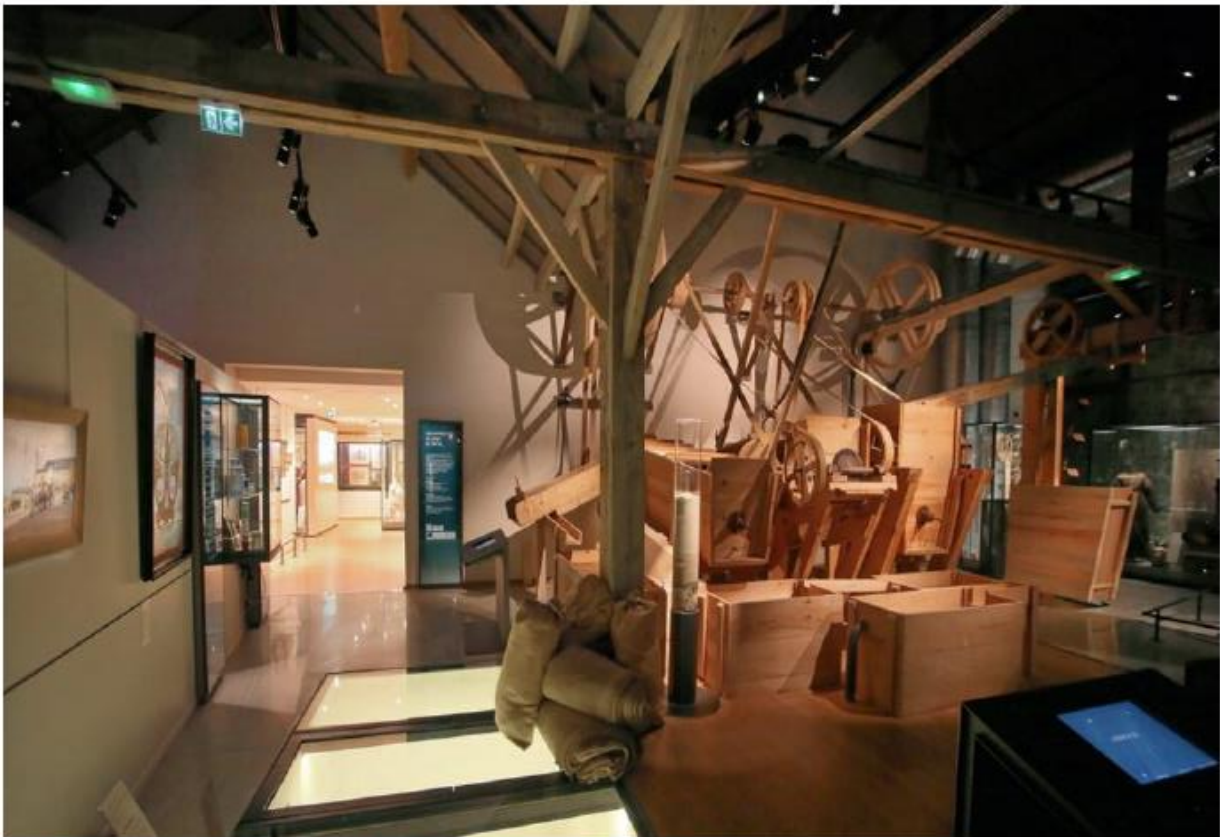
Batz-sur-Mer Salt Laundry, the new museum