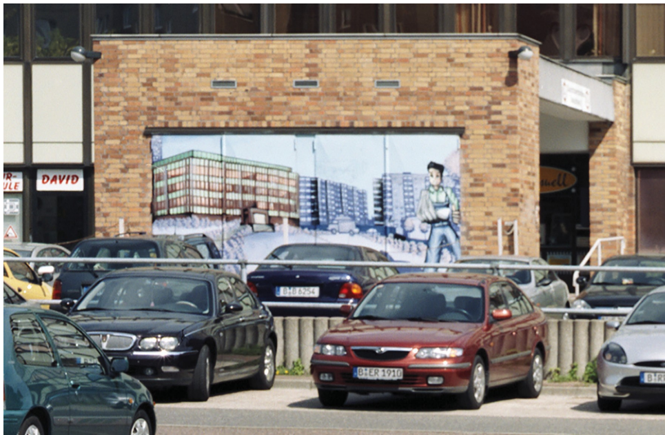
FIGURE 7: Jochen and Josepha Hinrich, 16 August 2006, detail

We can see in Jochen's interest in the mural an attempt to revitalize the emblem of the socialist city formerly embodied by Marzahn. Interestingly, it does not feature the buildings that are typically used to show the 'Platte' model (see Figure 6), but a prototypical office building, which has housed public services and administrations