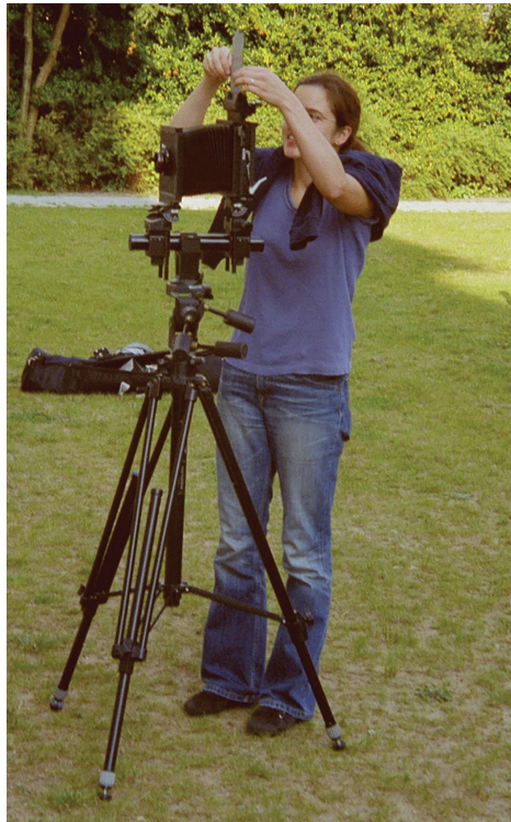
FIGURE 2: Large-format camera, September 2005

Unlike some of the visual methods discussed above (Latham, 2004; Degen and Rose, 2012; Schoepfer, 2014), my protocol does not entirely hand over shot production to the subjects. The aim is to introduce into the shooting situation, but also into the image, a difference between—on the one hand—the viewpoint of my subjects, situated within the field of view and facing the lens, and—on the other hand—that of a fictitious viewer, whose presence is nevertheless explicitly marked in space by the position of the camera. This difference makes the choice of viewpoint—and with it, the position of the fictitious viewer—an important factor in my discussions with the participants, which prompts them to explain how they want to represent the space for others. This reflexivity is absent from visual methods in which the aim of the interviews is to use a physical image—whose form is considered as already ‘made’ at the time of interviewing—as a starting point for a narrative of space. My experimental approach seeks to place the participants in the position of accommodating to and, in some cases, contesting the order of visibility in which they usually live, as my protocol asks them to combine the representation of themselves and of the space within a single view. In other words, it asks them to identify with the place they live in, in the knowledge that this process is highly problematic and will trigger discussion.