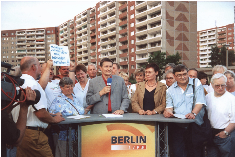
FIGURE 6: Shooting of a local television broadcast in the large-scale housing estate of Marzahn, 2003