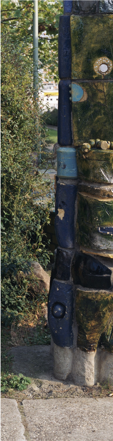
FIGURE 12: Martin Witte, 24 September 2005, detail