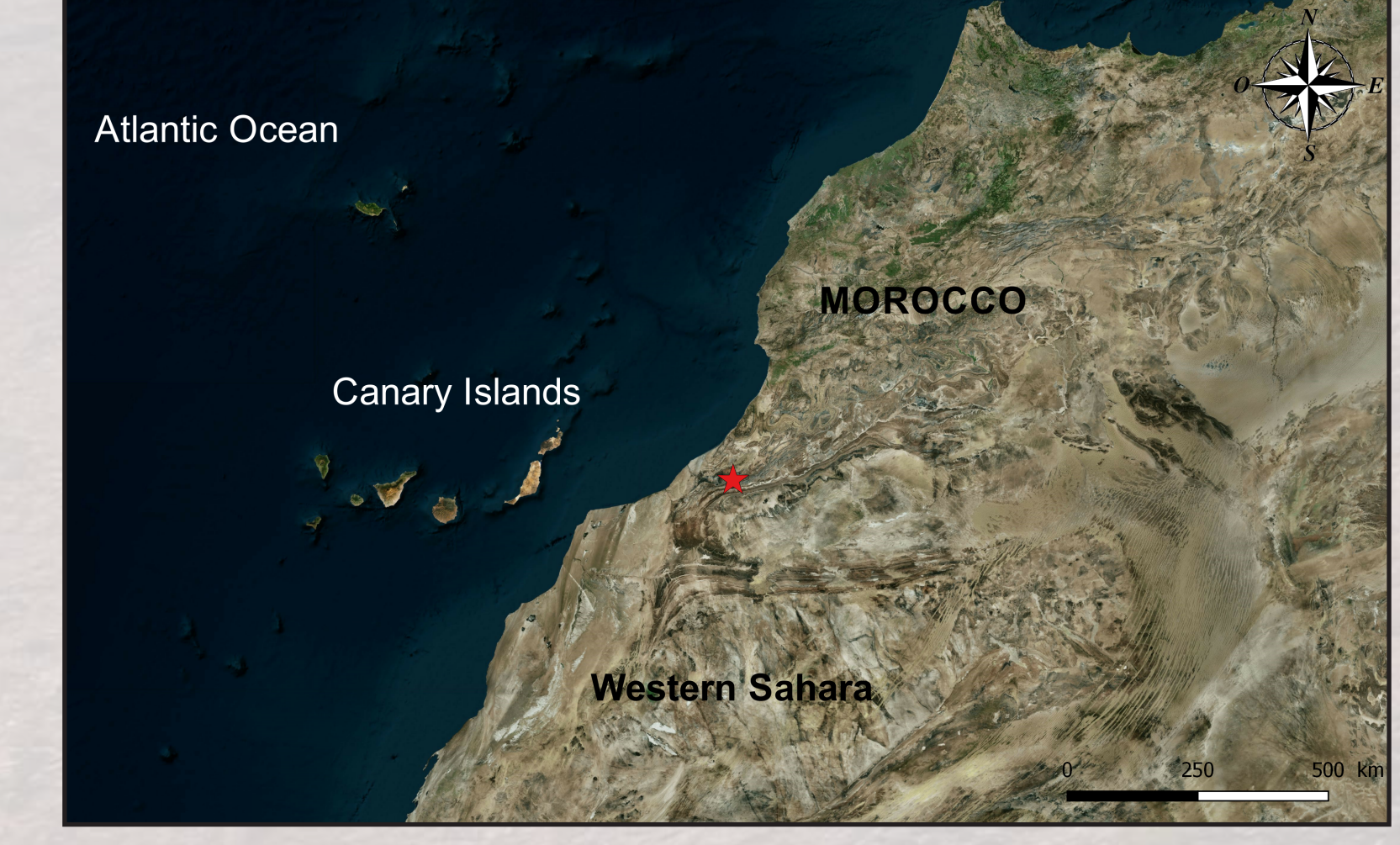
Situation map of Azrou Iklane (© Microsoft Corporation; J. Masson Mourey)

Azrou Iklane is located in south-west Morocco, about 200 km south of Agadir, on the southern edge of the Anti-Atlas. The site is a summer camp for various groups of the Aït Oussa Arabic tribe, which makes it an area for important social expressions. It is characterized by the presence, on the dry river bed of the oued, of a slab of brown quartzitic sandstone 140 m long by 20 m wide were the engravings were made.