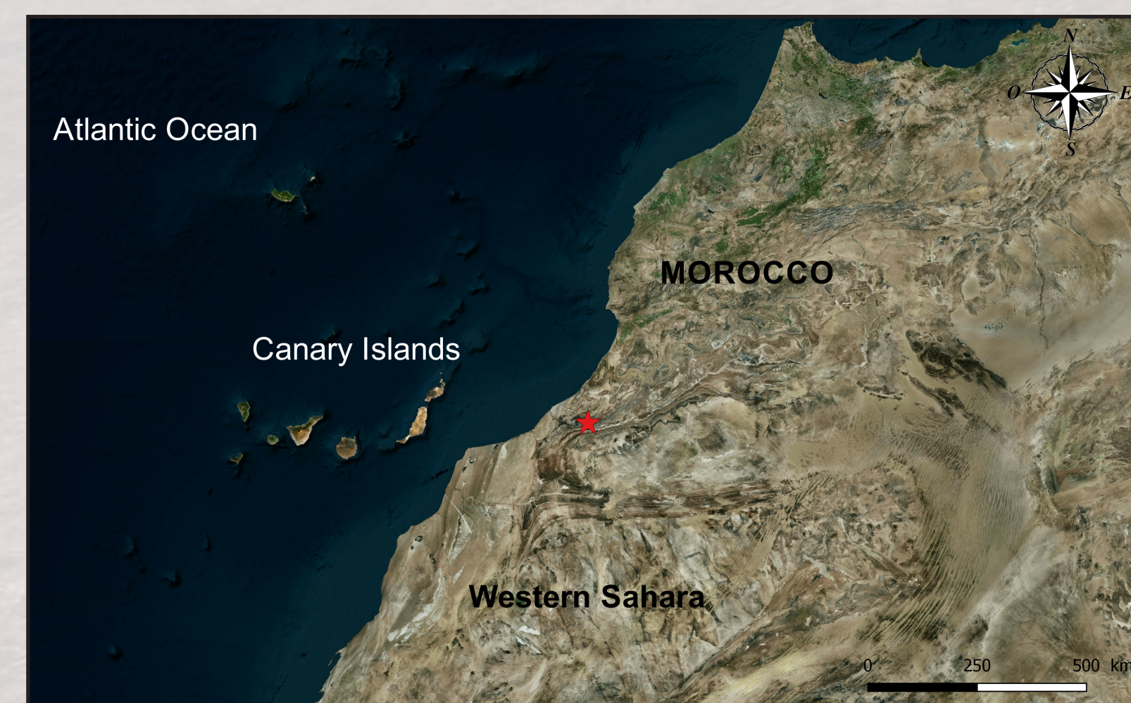
Situation map of Azrou Iklane

Azrou Iklane is located in south-west Morocco, about 200 km south of Agadir, on the southern edge of the Anti-Atlas. The site is a summer camp for various groups of the Aït Oussa Arabic tribe, which makes it an area for important social expressions. It is characterized by the presence, on the dry river bed of the oued, of a slab of brown quartzitic sandstone 140 m long by 20 m wide where the engravings were made.