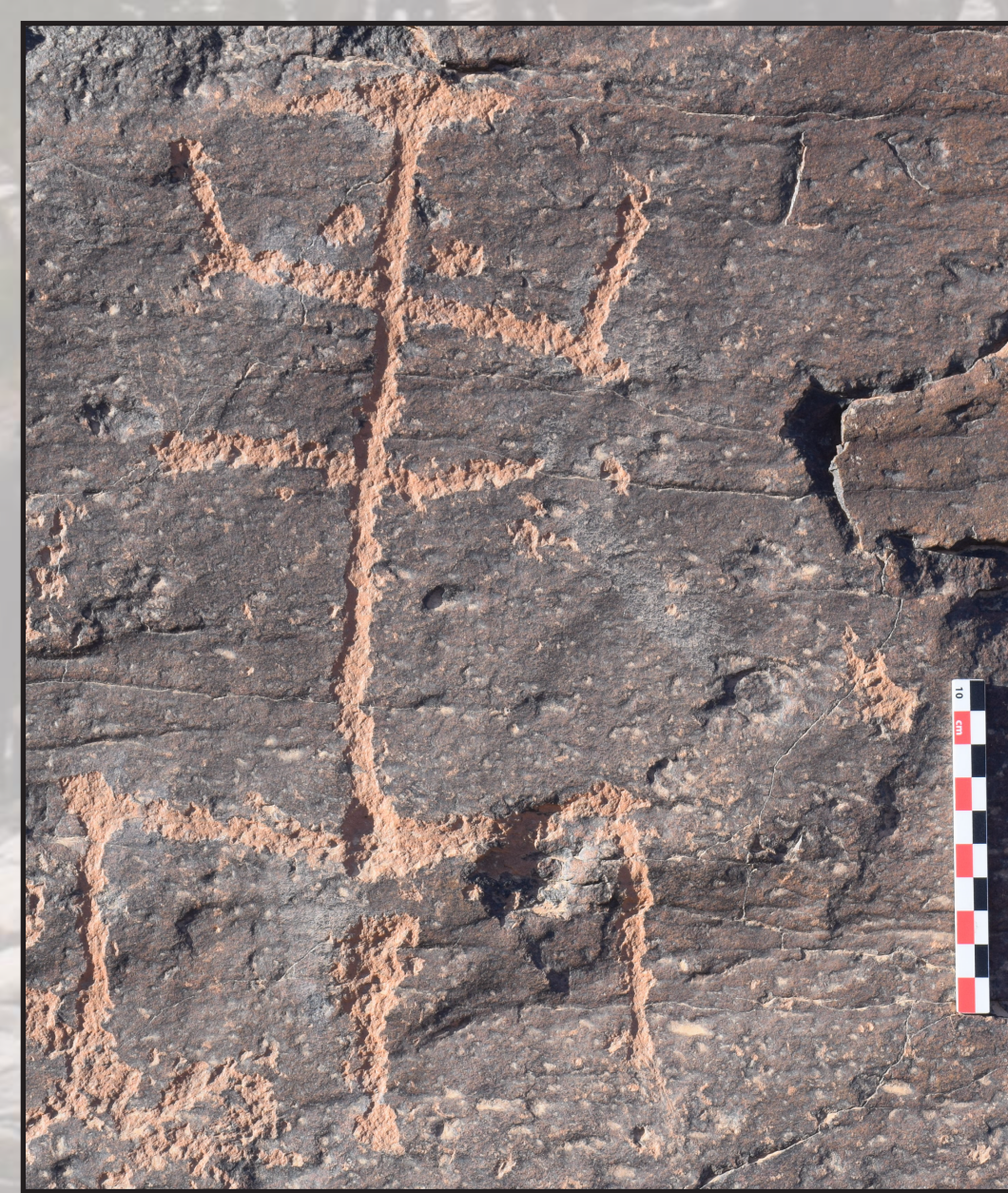
(© JMM ; Mission « Paysages Gravés »)

For the more recent phases, some anthropomorphs are strongly sexed (often male), others not at all. Some have two points represented on or below the shoulders. Many anthropomorphs for which there are few comparisons off the site display an enigmatic horizontal line crossing the body from side to side. Are they daggers or swords ? Sometimes, the hands of the characters are figured with outsized fingers and spread out.