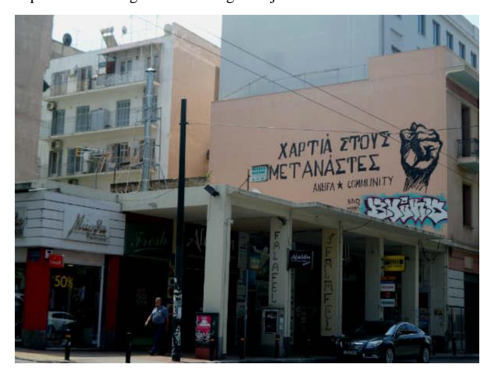
Picture 3 – 28th Oktovriou' street 'papers to the immigrants' [χαρτιά στους μετανάστες]

There is an intensive frequency in discourses of the outdoor unauthorised graphics concerning gender equality and the 'lesbian, gay, bisexual and transgender' (LGBT) movements. Although in Greece the law has progressed significantly over the