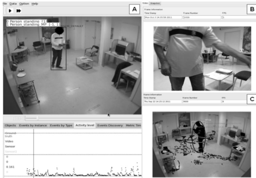
Fig. 8 Participant’ activities by the point of view of different sensors: (A) RGB camera view and actimetry provided the inertial sensor (the bottom of image A); (B) RGB-D camera view of participant, which shows the inertial sensor worn by the participant; and (C) Drawn points on the ground represent the trajectory information of the participant during the experimentation.