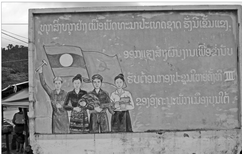
Plate 10.2a–b The two sides of the Boun Tai district signboard (Phongsaly province) show two representations of Lao citizens. One side expresses ethnicity by displaying the ethnic diversity of the district through images of women wearing “representative” dresses and united around the woman of the dominant ethnic group (usually the Lao, but since there are no Lao in this district, a Tai Lu woman is instead being depicted). The other side embodies social class, represented by various professions united for the development of the country.