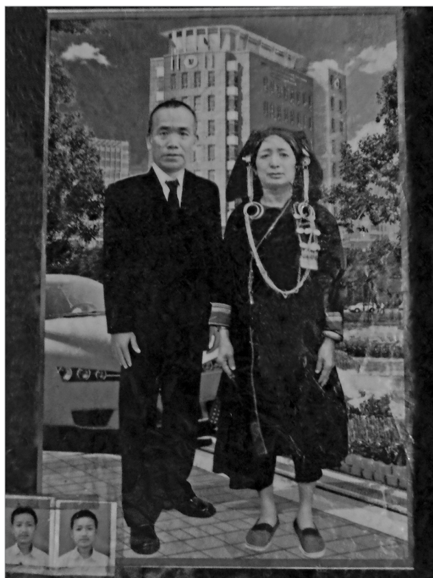
Plate 10.4 This picture, whose style is very common in northern Laos, is a cutout image of an Akha Pusho couple; in the background is a picture selected from a large choice of images depicting how “modernity” is appreciated.

than the Lao majority. This top-down model of civic nationalism (addressing all citizens regardless of their ethnicity) has gradually evolved into a more flexible model, though based on ethnic nationalism focusing above all on the sole Lao culture (Evans 2003b). At the same time, minority groups are gradually opening up to the members of their communities living in other countries—notably, through the circulation of cultural goods (CDs and DVDs from China, Vietnam, and Thailand) and by visiting relatives that have emigrated to Western countries (the United States, France, Australia, etc.). Time will tell how the country will evolve following this new path.