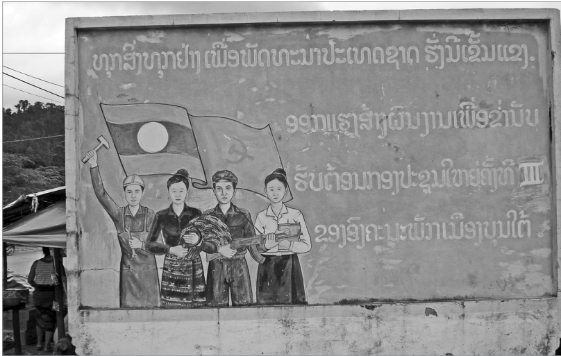
Plate 10.2a–b The two sides of the Boun Tai district signboard (Phongsaly province) show two representations of Lao citizens. One side expresses ethnicity by displaying the ethnic diversity of the district through images of women wearing “representative” dresses and united around the woman of the dominant ethnic group (usually the Lao, but since there are no Lao in this district, a Tai Lu woman is instead being depicted). The other side embodies social class, represented by various professions united for the development of the country.