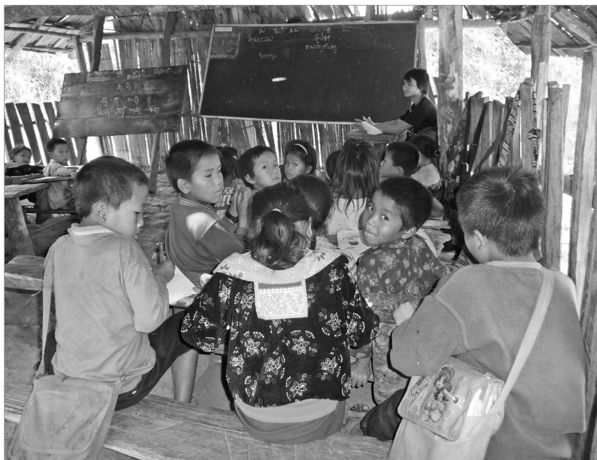
Plate 10.3 Schooling in Lao language (here, of Hmong pupils), aimed at national integration, instructing respect for state rule, and favoring inter-ethnic interactions, as well as the opening up of possibilities to integrate state administration.

mobility of villages, exploitation of forest resources, sometimes smuggling (including cross-border forays) and prohibited crops such as opium, the objectives are multiple: preservation of forest areas from clearing, fixing populations, development of rice and cash crops, securing border areas emptied of their population, and infrastructure development (schools, dispensaries, markets, roads)—which include the ability to raise taxes, as well as greater control over the country's natural resources (timber, minerals, agricultural land). There is thus a convergence of developmental, security, environmental, social, and political objectives, one or the other being more or less highlighted as the government promotes its policy among the population, businesses, international donors, or NGOs.