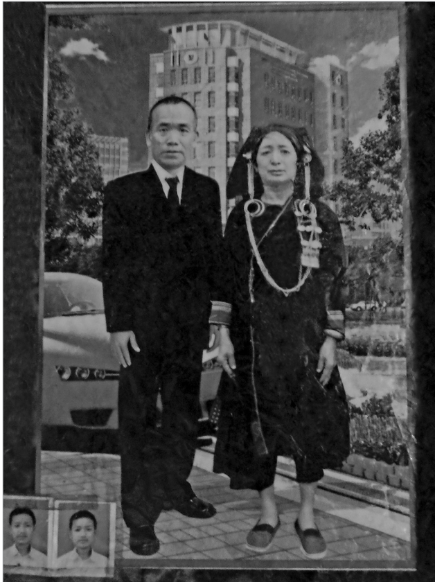
Plate 10.4 This picture, whose style is very common in northern Laos, is a cutout image of an Akha Pusho couple; in the background is a picture selected from a large choice of images depicting how “modernity” is appreciated.

than the Lao majority. This top-down model of civic nationalism (addressing all citizens regardless of their ethnicity) has gradually evolved into a more flexible model, though based on ethnic nationalism focusing above all on the sole Lao culture (Evans 2003b). At the same time, minority groups are gradually opening up to the members of their communities living in other countries—notably, through the circulation of cultural goods (CDs and DVDs from China, Vietnam, and Thailand) and by visiting relatives that have emigrated to Western countries (the United States, France, Australia, etc.). Time will tell how the country will evolve following this new path.