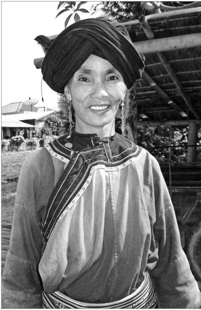
Plate 10.1 Costumes are not always an ethnic marker. Indeed, only the belt worn by this woman enables us to recognize her as Lolo. Lolo clothes are similar to the Ho/Chinese population's (and vary according to localization as much as ethnic belonging), and come from Yunnan, where they were fashionable in the 19th century.

a field, a village, or a region) and thus transcend ethnic boundaries. All this makes it possible to identify a common ritual logic to a vast and diverse set of people. 8 Finally, relationships drawing on ethnicity are rarely mobilized and have little practical effect: ethnicity defines a set of relations of possible communications, unions, and solidarity (sometimes more expected than real). But in practice, the vast majority of interactions and exchanges that makes up the daily life of groups occurs at the village or county level.