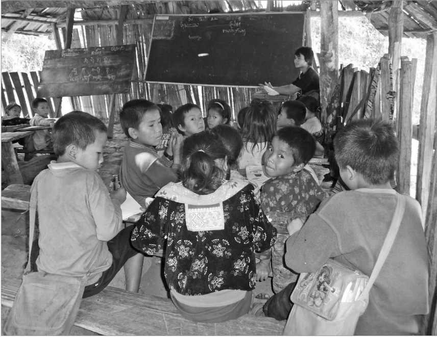
Plate 10.3 Schooling in Lao language (here, of Hmong pupils), aimed at national integration, instructing respect for state rule, and favoring inter-ethnic interactions, as well as the opening up of possibilities to integrate state administration.

mobility of villages, exploitation of forest resources, sometimes smuggling (including cross-border forays) and prohibited crops such as opium, the objectives are multiple: preservation of forest areas from clearing, fixing populations, development of rice and cash crops, securing border areas emptied of their population, and infrastructure development (schools, dispensaries, markets, roads)—which include the ability to raise taxes, as well as greater control over the country's natural resources (timber, minerals, agricultural land). There is thus a convergence of developmental, security, environmental, social, and political objectives, one or the other being more or less highlighted as the government promotes its policy among the population, businesses, international donors, or NGOs.