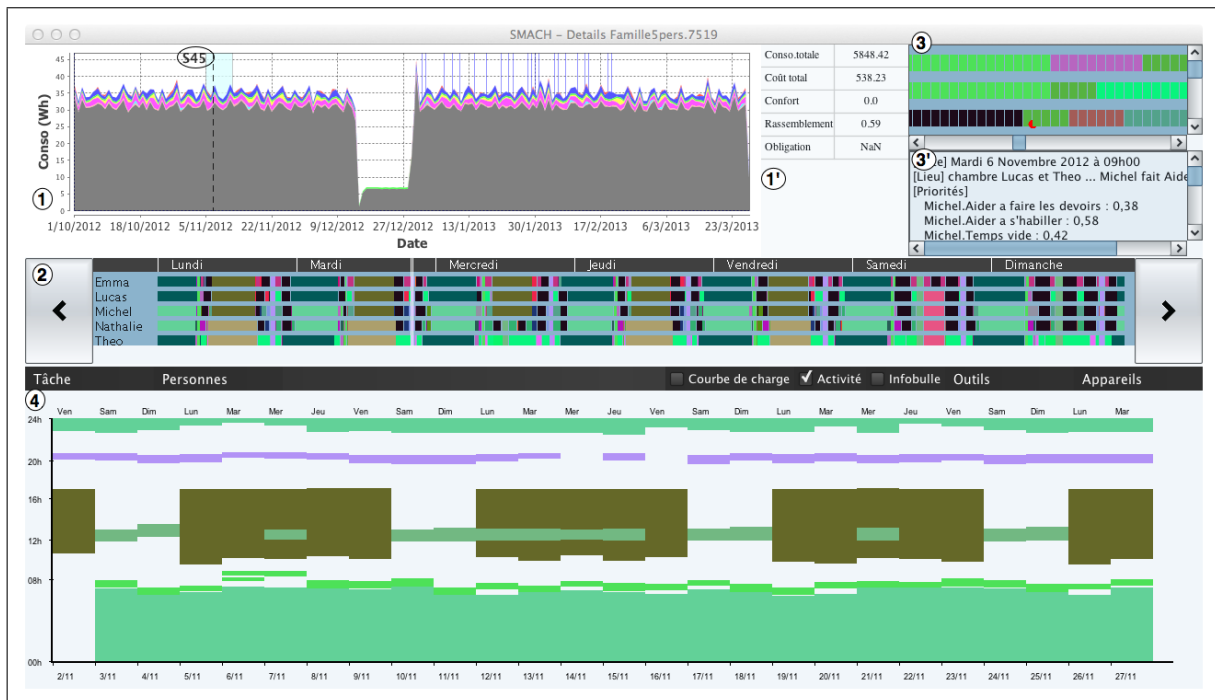
Figure 1: SMACH GUI (analysis mode)