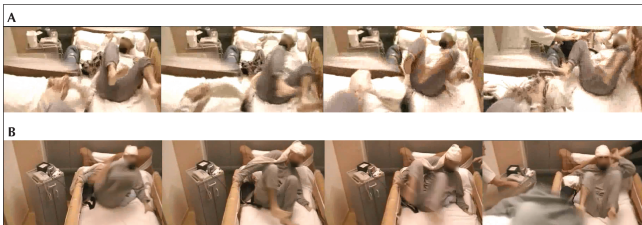
Figure 2. Sequences of hyperkinetic signs for the two types of seizures (lasting for 30 seconds) with (A) right temporo-polar onset and (B) left temporo-perisylvian onset.

previously been identified as a potential source of hyperkinetic seizures. In particular, temporo-frontal seizures (with preferential involvement of the temporal pole and orbital frontal cortex) (Nobili et al. , 2004; Vaugier et al. , 2009) have been reported with ictal hyperkinetic motor behaviour. Hyperkinetic motor