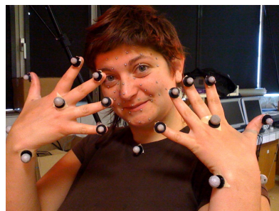
Figure 2: Photo of the MoCap settings in SignCom project.

In HuGEx project (Gibet et al., 2006), the Vicon system was composed of 12 infrared cameras cadenced at 120Hz. For the body movements 24 reflective markers were placed