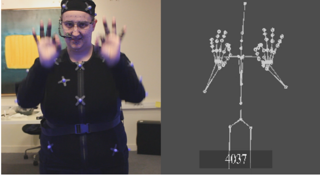
Figure 3: Photo of the MoCap settings in Sign3D project.

data. This is necessary for annotation. Body movements, hand and finger movements, and facial expressions were recorded simultaneously by the Vicon system. Two professional deaf linguists signing in LSF designed the corpus, and learned it by heart. During the recording session, the information was presented to the deaf signers through images projections, so that the signers were able to recall the scenarios without reading any text-based translation. 68 motion sequences were recorded on one signer. This constitutes the SignCom database containing about one hour of MoCap data. From this data (in C3D format), a skeleton was reconstructed, and the data (body and hand movements, as well as facial expressions) was converted into the formats BVH and FBX.