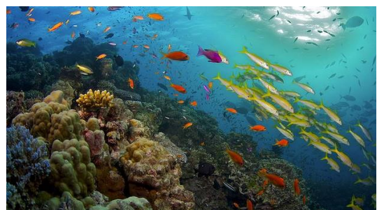
Fig. 3. Image from: https://conservationbytes.com/2014/01/08/more-species-more-resilience/

I see as of little surprise, and rather pleasing, that the versatility of our jobs is being reflected in the diversity of University Mathematics Education research that is now presented at CERME. This diversity of focus – but also theoretical perspective and methodology – is to me a sign of richness. In fact, here I have taken the liberty of endorsing a metaphor, which originates in currently dominant theories of evolution and conservation (Figure 3). These theories equate species diversity with resilience. The story I tell here relies somewhat on whether this is a convincing metaphor.