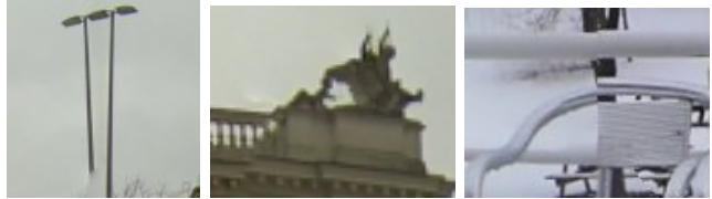
Fig. 1. Examples of parallax errors in panoramic videos.

To overcome these limitations, we suggest to use a quality metric originally designed for novel view synthesized images [1]. The similarity between both domains, which fall into the category of IBR (Image-Based Rendering), makes them suffer similar artifacts. We propose a solution to the lack of a reference image by calculating the metric between overlapping regions of pair-wise matches in the original views prior to blending. We then construct a global map for the whole panorama to which we apply a weighting mask that