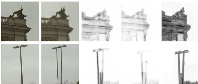
Fig. 4. Zoom on error in Opera sequence. Top row is panorama at time t=105 , the one below is t=385 . Then from left to right, the figure shows the original view before stitching, then the image after being stitched. Then the error maps for VSQA, MVSQA and SSIM respectively are shown.

In order to obtain a metric index out of our distortion map, we calculated a score according to [1], which consists in counting the number of remaining erroneous pixels after applying a threshold. We used the same method of spatial pooling to compare our results with basic SSIM. Table I shows the resulting scores in percent of remaining pixels for VSQA and MVSQA described in equations 2 and 4 as well as basic SSIM [5]. The measures were applied to 3 chosen frames where we could see clear parallax errors. Figure 4 shows examples of parallax errors that appeared after stitching and their corresponding maps VSQA, MVSQA and SSIM.