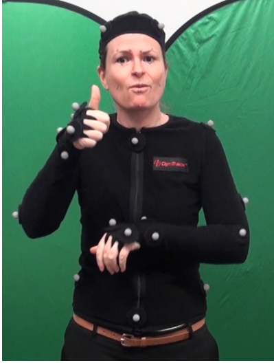
Figure 3: Snapshot of the collected data.

We have conducted five sessions using the protocol and material above, each with a different informant. We included them as two tasks of the more general mocap 8 corpus collected last year (El-Fatah Benchiheub et al., 2016). In those sessions, a single face view was collected, including mocap markers on the face for the benefit of the other target studies (fig. 3). The data is still readable for traditional video observation.