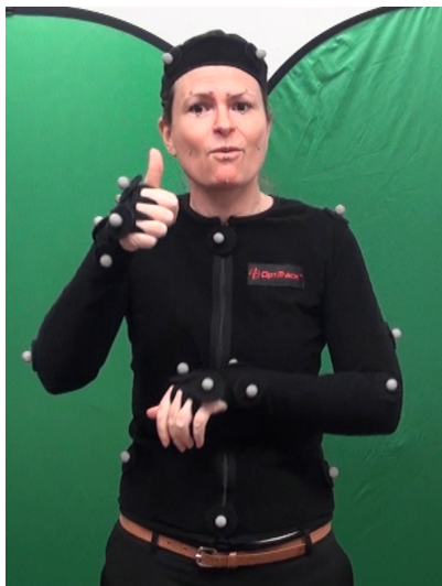
Figure 3: Snapshot of the collected data.

We have conducted five sessions using the protocol and material above, each with a different informant. We included them as two tasks of the more general mocap 8 corpus collected last year (El-Fatah Benchiheub et al., 2016). In those sessions, a single face view was collected, including mocap markers on the face for the benefit of the other target studies (fig. 3). The data is still readable for traditional video observation.