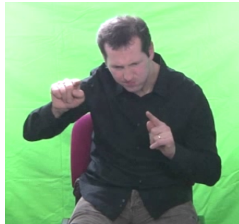
Figure 1: Data distortion in the DictaSign map task.

A map task in the DGS Korpus project was planned and actually even aborted after its pilot test for that reason (Hanke et al., 2010). A similar task was nonetheless conducted in DictaSign, using a screen under the camera so that the informant could see it at any time. The result is a strong effect throughout the task, frequently as obvious as postures held with arms stopped in a physically constrained position, back hunched, eyes apparently locked on the helper screen, squinting and scanning its contents, until the signing resumes (fig. 1). In such case, like in the DGS Korpus map task, data distortion is too strong and the data is no more useable to inform studies of regular SL gestures.