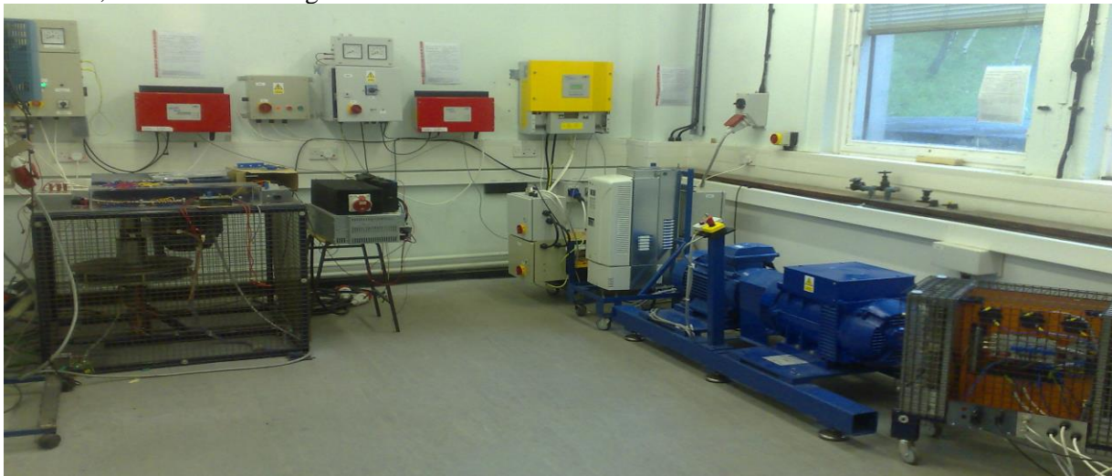
Figure 3: View of the experimental MicroGrid at Durham University

A laboratory based experimental MicroGrid is currently under development at Durham University [18-19]. The experimental MicroGrid consists of one load emulator, one wind turbine generator emulator, one PV generation emulator, one dCHP emulator, one ESU emulator and one network connection emulator, as illustrated in Figure 3.