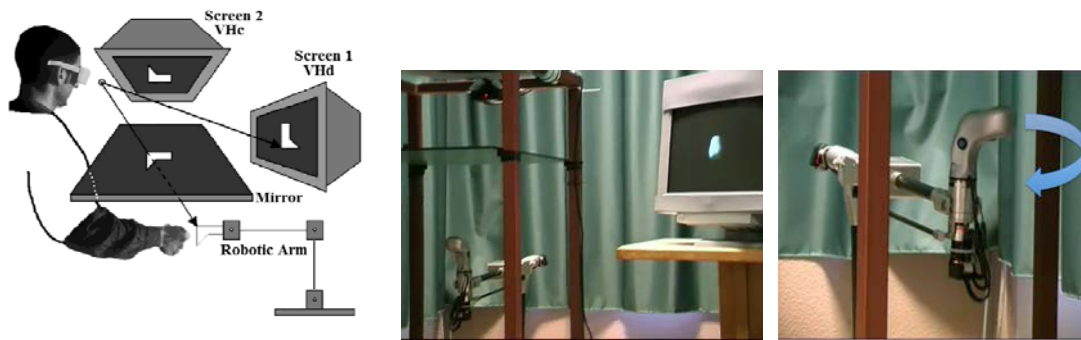
Figure 1: What happens when vision and touch are not collocated? In our experiment (Congedo, 2006), participants could watch and grasp a rotating virtual handle under two different conditions: VHc (Visual and Haptic information are spatially “Collocated” - as in HMD-based VR settings) and VHd (Vision and Haptics are “De-located”, as in screen-based VR settings).

Sensory redundancy is an effective means for gaining a higher immersion. But the sensory stimulations are expected to remain consistent spatially and temporally. A spatial or temporal discrepancy between sensory sources is expected to decrease the plausibility of the virtual experience. In (Congedo, 2006), we could show that when visual and haptic information are not spatially collocated, the multi-sensory integration is negatively impacted, and the weight given to the haptic modality decreases strongly in favor of vision (see Figure 1). The spatial offset between the visual and haptic displays ends up with a masking of the haptic sensation. Interestingly, designers of VR systems can relate these findings to the relevance of the two sensory channels. For instance, if the contribution of touch is important for the task, great efforts should be undertaken to collocate as much as possible the visual and haptic percepts. On the other hand, in presence of a low-quality haptic feedback, the interest may be to contain the limitations of the haptic device by keeping distant the two displays.