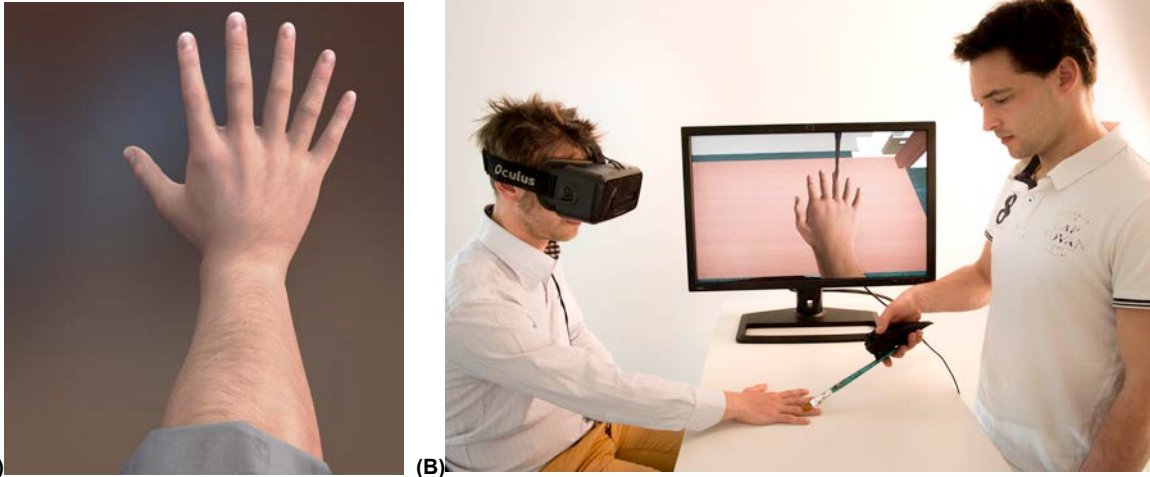
(A) (B) Figure 4: The 6-Finger Illusion (Hoyet, 2016). (A) 3D model of the 6-digit hand used in our experiment. (B) Experimental procedure for visuo-tactile stimulation.

Such conditioning protocol relying on synchronized visuo-tactile stimulations shows great potential for augmenting virtual embodiment in VR. Adding haptic cues synchronized with visual ones seems indeed to increase strongly the belief of participants, and could be encouraged when targeting applications in which the virtual body of the user plays an important role. In addition to videogames and immersive entertainment, we can think of numerous applications such as vocational or sport training, but also cybertherapy, or motor re-education.