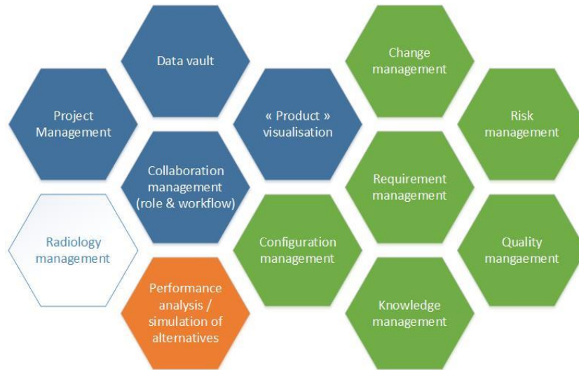
Fig. 2. BIM-PLM functionalities elicited for NFD: in green PLM-specific functionalities, in red BIM-specific ones, in blue BIM-PLM common ones and in white NFD-specific one.