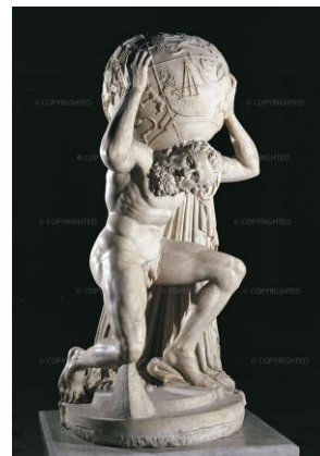
Fig.2 : Pirro Ligorio (British Museum) and Atlante Farnèse (Museo archeologico di Napoli).