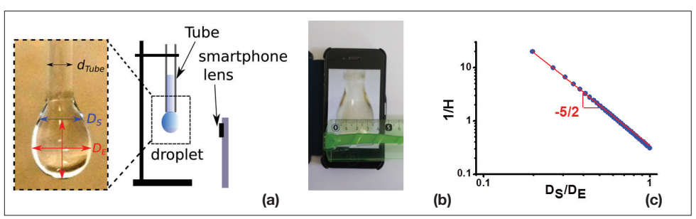
Fig. 1. (a) Water droplet suspended at the tip of a Pasteur pipette. (b) Illustration of the measurement of the diameters directly on the screen of the smartphone with a simple ruler. (c) 1/H as a function of the ratio D_S/D_{E^*}^{10} Note the logarithmic scale on the axes.

ing it out of a liquid reservoir. The experiment has also been tested with standard straws such as the tube of a pen ( d_{Tube} \approx 2.9 \text{ mm} ) or McDonald's straw ( d_{Tube} \approx 5.9 \text{ mm} ) instead of Pasteur pipette to test the generality of our approach. The smartphone used in the experiment is an iPhone 4s (camera sensor 8 MPixels, display 640×960 pixels, 3.5-in screen) and the standard camera function of the smartphone