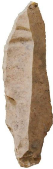
Figure 2 (b) Balibo, Dua Nelle surface find. Scraper (scale is 1 cm)