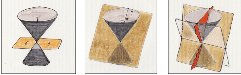
Figure 1. Three types of isometries (from left to right): Elliptic, parabolic, and loxodromic. Elliptic isometries preserve a point in \mathbb{H}_m and act as a rotation on the orthogonal complement. Parabolic isometries fix an isotropic vector v ; the orthogonal complement of \mathbf{R}v contains it, and is tangent to the isotropic cone. Loxodromic isometries dilate an isotropic line, contract another one, and act as a rotation on the intersection of the planes tangent to the isotropic cone along those lines (see also Figure 2 below).

The metric space (\mathbb{H}_m, \text{dist}_m) is a Riemannian, simply-connected, and complete space of dimension m with constant sectional curvature -1 ; these properties uniquely characterize it up to isometry. (5)