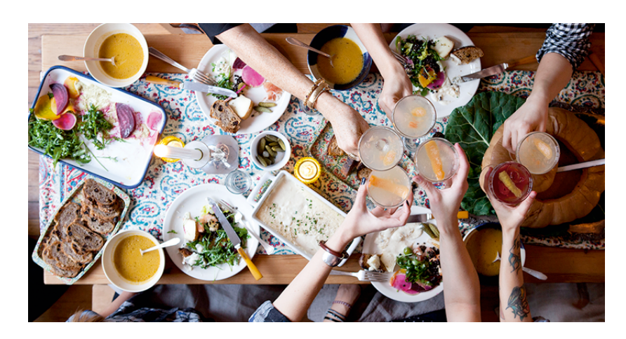
Traditional diets from different parts of the world look and taste very different, but many have an important common quality. They are based on foods of plant origin. Animal foods are used sparingly

It is surprising that in the early twenty-first century, a clear strategy of how best to eat for the health of humans and for the planet has not been really defined, or at least not exactly enough. But good guides are traditional dietary patterns that have proven nutritionally and environmentally healthy and sound, such as the Mediterranean or many Asian diets.