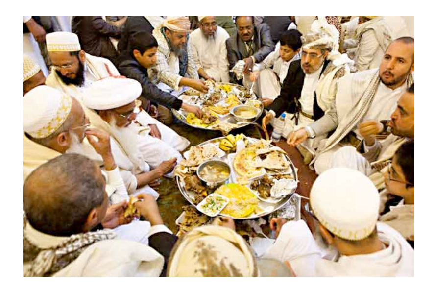
Another characteristic of traditional eating habits is commensality — the sharing of meals by families and friends, and often, as here, preparation of many dishes, mostly made from foods of plant origin

now become very high. For example, nearly one-third of the dietary energy consumed in France is of animal origin (4). Many people seem sceptical about vegetarianism. (Meaning, not eating meat – red meat, poultry, seafood and the flesh of any other animal – a stricter version of which is also avoidance of by-products of animal slaughter). But the respective share of animal and plant products in the human diet is now of paramount importance, to ensure adequate food availability for a fast-growing global population, to optimise the relationship between diet and health, and to reduce the ecological impact of agriculture and livestock (5,6).