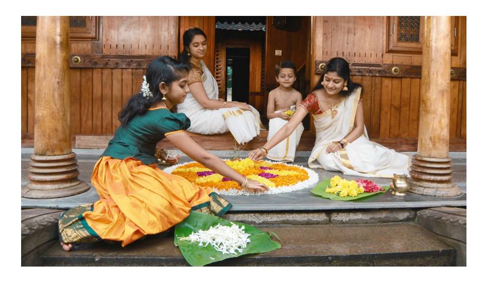
Traditional plant-based cuisines from all over the world also typically show a rich variety of colours, flavours and textures, from many types of food, made even more attractive by beautiful presentation

In addition to providing healthy types of carbohydrate, varied plant-based diets are more than adequate in protein and essential fatty acids. Populations whose diets are centred on animal foods consume an unnecessary amount of protein – perhaps around 90 grams a day, whereas 50-60 grams is fully adequate. It is still sometimes said that animal foods supply complete protein whereas plant foods do not. This is not true, as long as grains (cereals) are balanced with legumes (pulses), as they normally are in traditional plant-based dietary patterns all over the world. Lack of a complete range of essential amino acids is a problem only when plant-based diets are monotonous and based on grains such as wheat, rice, corn or millet.