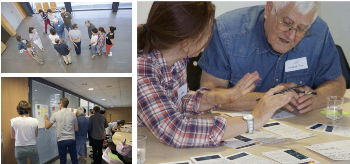
Figure 4 Workshop #2 June 2017

The results of this co-design workshop were very useful, as three maps of the care professionals and insomniac patients network were sketched, in order to express different visions of the sleep institute imagined by the participants. In addition, more than twenty digital tools at the service of the human network were produced, allowing to imagine the digital and healthcare services of the institute, the functions of the website and the connected object used to optimize the prevention, the support and the medical follow-up in sleep medicine.