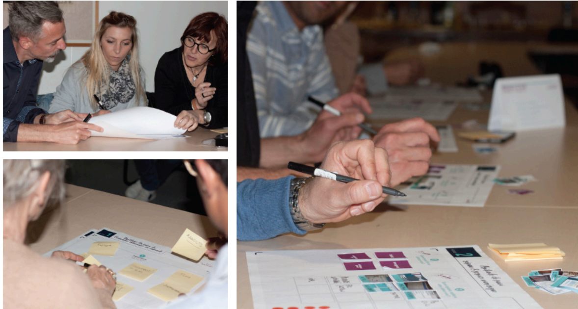
Figure 3 Workshop #1 April 2017

The second workshop of co-design at the beginning of June was made with patients, healthcare professionals and administrators. Different methods coming from game storming were used, based on activities made to use space as an expression of opinions, and also visual and creative methods. The participants were invited to work in small groups of three or four people, and each team had to mix patients with doctors, and a secretary or an administrator. Visual materials (such as game board, cards, personas, patient care journey, map-tools, map of the network etc.) were prepared by the designer and researcher and proposed to the participants to support their expression by playful and participative materials.