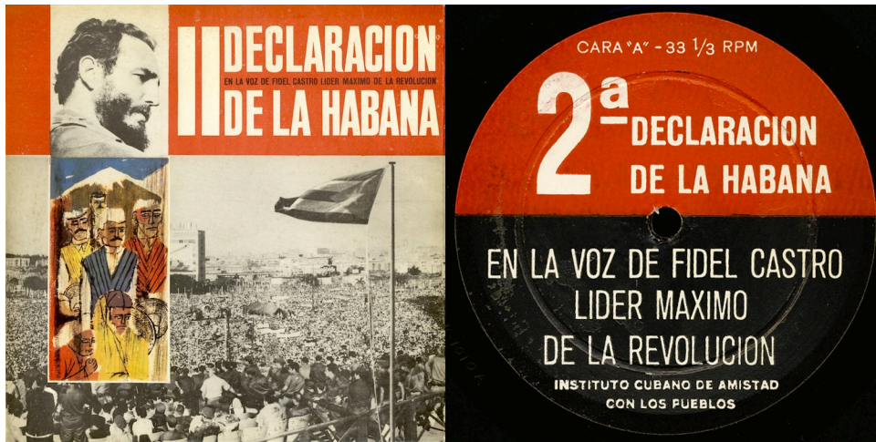
Image 2: Cover and label of the vinyl record of Fidel Castro's speech (given in Havana, February 4, 1962).

Cuba for the murdered teachers; the United States for the assassins. Cuba for the truth; the United States for lies. Cuba for liberation; the United States for oppression. Cuba for the bright future of humanity; the United States for the past without hope. Cuba for peace among peoples; the United States for aggression and war. Cuba for socialism; the United States for capitalism. 60