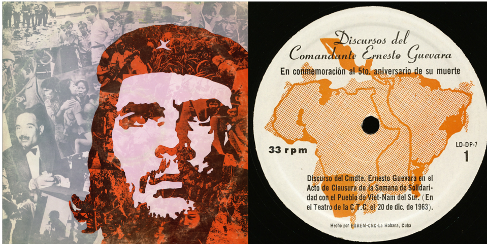
Image 1: Cover and label of the vinyl record of Ernesto “Che” Guevara’s speech (given in Havana, December 20, 1963).

The victory of peace for Vietnam and its right [to decide on its own socialist destiny] must be a new victory for the whole worker and anti-imperialist movement, on the path opened by the October Revolution, the Long March, and the Sierra Maestra [and from the growth and achievement of our resistance, for a new world]. 56