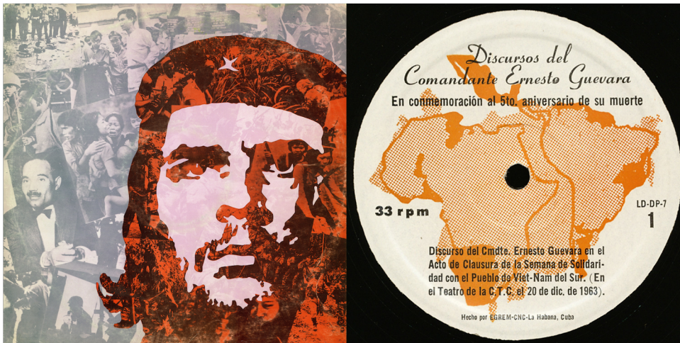
Image 1: Cover and label of the vinyl record of Ernesto “Che” Guevara’s speech (given in Havana, December 20, 1963).

The victory of peace for Vietnam and its right [to decide on its own socialist destiny] must be a new victory for the whole worker and anti-imperialist movement, on the path opened by the October Revolution, the Long March, and the Sierra Maestra [and from the growth and achievement of our resistance, for a new world]. 56