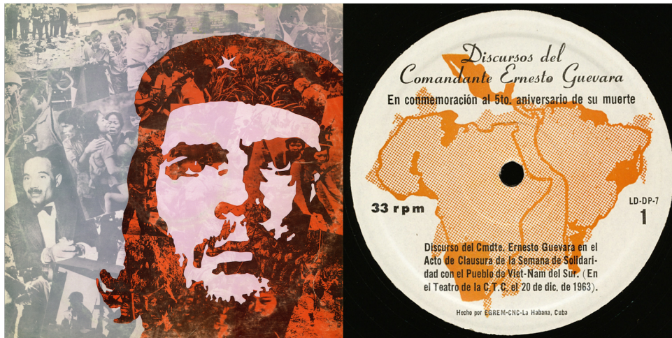
Image 1: Cover and label of the vinyl record of Ernesto “Che” Guevara’s speech (given in Havana, December 20, 1963).

The victory of peace for Vietnam and its right [to decide on its own socialist destiny] must be a new victory for the whole worker and anti-imperialist movement, on the path opened by the October Revolution, the Long March, and the Sierra Maestra [and from the growth and achievement of our resistance, for a new world]. 56