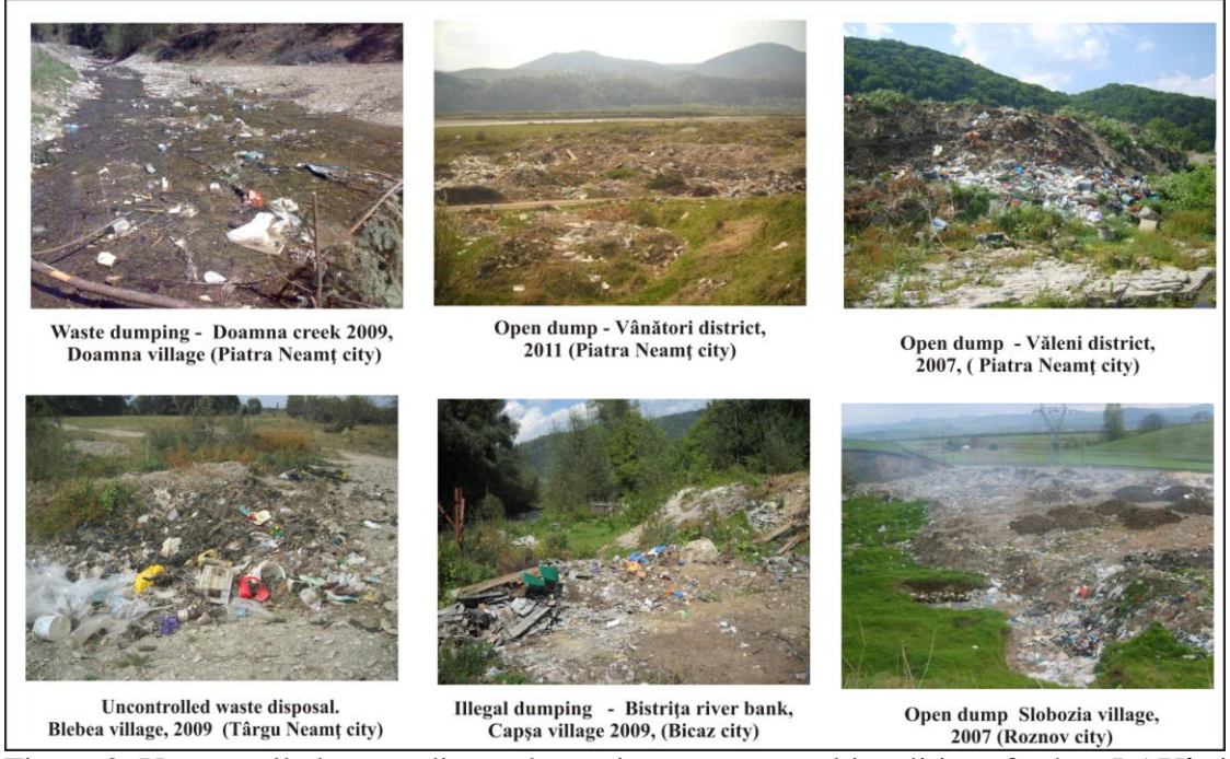
Figure 2. Uncontrolled waste disposal practices across rural localities of urban LAU's in Neamt county