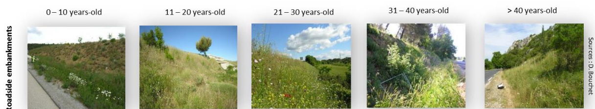
Fig. 1 Pictures of the chronosequence of roadside embankments

The stabilization of roadside embankments is a major challenge for land managers worldwide. While most studies focused on the short-term influence of revegetation measures (such as planting or hydroseeding) on soil stabilization, little is known about the long-term effect of successional dynamics occurring along roadsides. Our aim is to explore the influence of a vegetation successional dynamic on the stabilization of soil aggregates, a proxy for soil stability, along a 70-years roadside chronosequence. We selected 24 plots (16 x 4 m) on embankments along roadsides in the Mediterranean region (South France), spread into 5 age-classes (0-10; 11-20; 21-30; 31-40 and >40 years-old, Fig.1).