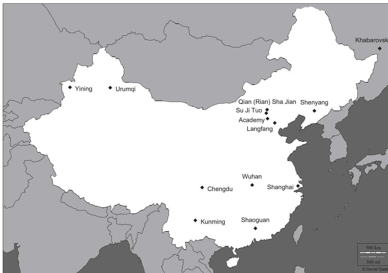
Fig. 1 Map of the sampling sites in China and Eastern Russia.

clusters ( K ) between 1 and 6 and performed 20 independent runs for each value of K . Each Markov chain was run for 200 000 steps, after a 50 000-step burn-in period, using the admixture model for correlations of allele frequencies across clusters, with the default value for parameter \alpha and the default prior for F_{ST} .