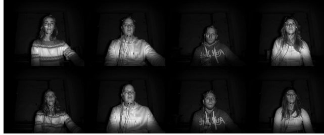
Fig. 1. Examples of NIR frames from DROZY database.

Subjects were instructed to monitor a red rectangular box over a black background on a computer screen, and to press a response button as soon as they noticed the appearance of a yellow stimulus counter within the box. Videos are recorded with an artificial near-infrared illumination using a Microsoft Kinect v2 sensor which provides frames of size 512x424 pixels at 30 frames per second for a duration of 10 minutes. Figure 1 shows examples of NIR frames.