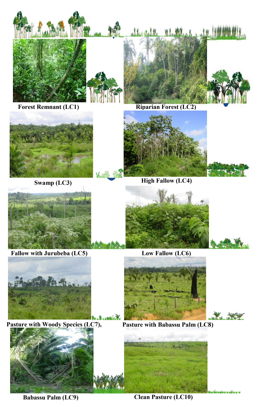
Figure 2. Landscape components of the SP-Benfica, southeastern of Pará State, Itupiranga municipality, Brazil.