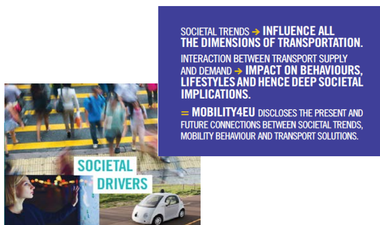
Figure 1: Relation of societal factors with Mobility4EU project

Global socio-economic and environmental megatrends are urging for a paradigm shift in mobility and transport that involves disruptive technologies and multimodal solutions. The individual transport sectors face diverse technical and non-technical requirements and rather individual, sometimes contradicting challenges. An action plan for the coherent implementation of innovative transport and mobility solutions in Europe is thus urgently needed and should be sustained by a wide range of societal stakeholders. The approach we follow in MOBILITY4EU project is to work towards the development of such a plan taking into account all modes of transport, as well as a multitude of societal drivers encompassing health, environment and climate protection, public safety and security, demographic change, urbanisation and globalisation, economic development, digitalisation and smart system integration.