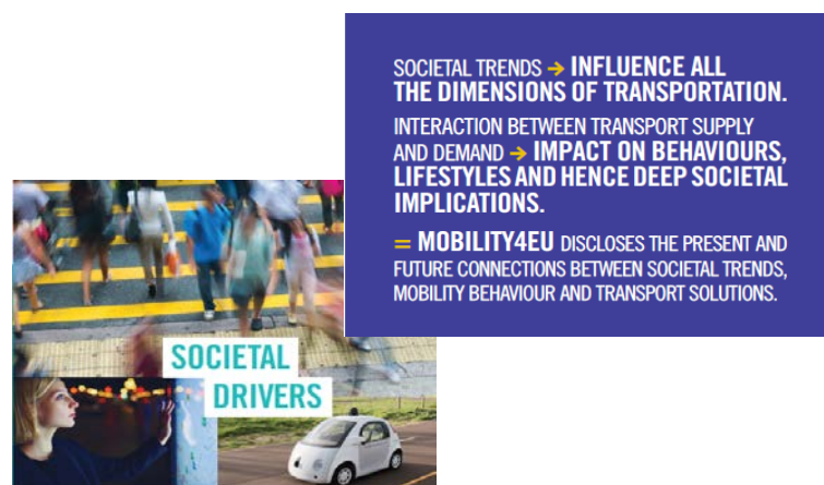
Figure 1: Relation of societal factors with Mobility4EU project

Global socio-economic and environmental megatrends are urging for a paradigm shift in mobility and transport that involves disruptive technologies and multimodal solutions. The individual transport sectors face diverse technical and non-technical requirements and rather individual, sometimes contradicting challenges. An action plan for the coherent implementation of innovative transport and mobility solutions in Europe is thus urgently needed and should be sustained by a wide range of societal stakeholders. The approach we follow in MOBILITY4EU project is to work towards the development of such a plan taking into account all modes of transport, as well as a multitude of societal drivers encompassing health, environment and climate protection, public safety and security, demographic change, urbanisation and globalisation, economic development, digitalisation and smart system integration.