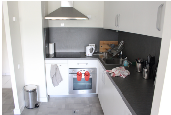
Figure 2: Instrumented kitchen in the smart home.

consortium— services, functionalities and interaction modalities (voice feedback, HMI) of the future device. 3) Finally, a final phase consists in evaluating and testing the prototype in the actual living situation, at home itself, in order to understand the difficulties of use and the various impacts, acceptable or not, of the Vocadem system on the systems of activity of the various actors in the home. The objective is to evaluate whether the VocADom system provides real efficiency and makes it possible to maintain meaning (on social, identity, relational and organisational dimensions) in the activities carried out at home.