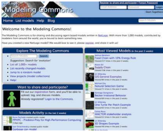
Figure 1.3. Modeling Commons homepage (March 2016)

The first step is to create a user account (using the platform is completely free). This is only required if you wish to save models online, edit them, or comment on existing models. Browsing and downloading public models do not require logging in.