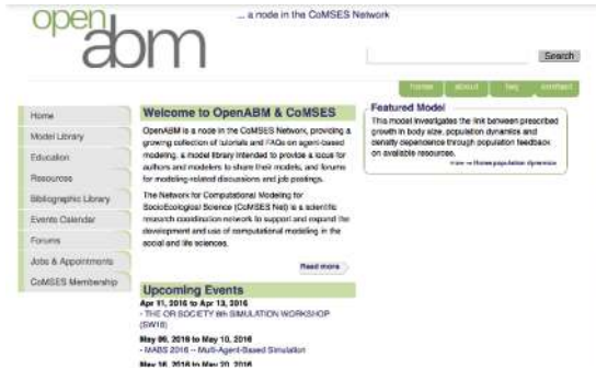
Figure 1.6. OpenAbm.org homepage (March 2016)

They already have a very extensive library of community-submitted models. Each model is documented, and the source code is provided.