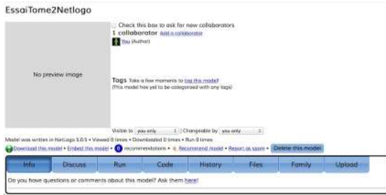
Figure 1.5. Model management window (March 2016)

code, version history, auxiliary model files, models belonging to the same family (we will return to this concept later) and an update tab (Figure 1.5). This final tab allows you to upload an updated version of the model.