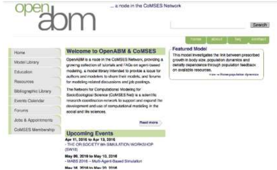
Figure 1.6. OpenAbm.org homepage (March 2016)

They already have a very extensive library of community-submitted models. Each model is documented, and the source code is provided.