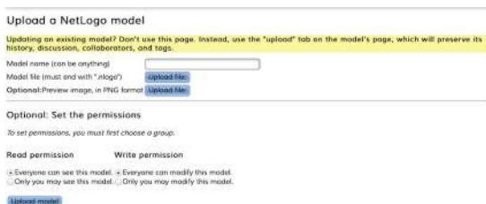
Figure 1.4. Interface for uploading a model (March 2016)

You can now upload a model (Figure 1.4). The platform will ask you to specify the name of the model, provide the filepath on your computer and optionally upload an image as an illustration. The reading and writing permissions of the model must then be selected. The model can be set to either public or private – collaborators can always be added at a later point.