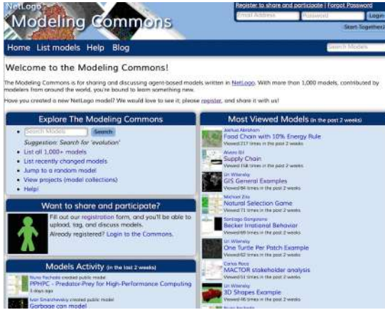
Figure 1.3. Modeling Commons homepage (March 2016)

The first step is to create a user account (using the platform is completely free). This is only required if you wish to save models online, edit them, or comment on existing models. Browsing and downloading public models do not require logging in.