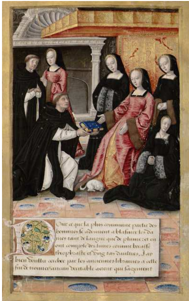
Anne de Bretagne and her ladies-in-waiting receiving from Antoine Dufour the manuscript 'Les vies des femmes célèbres'