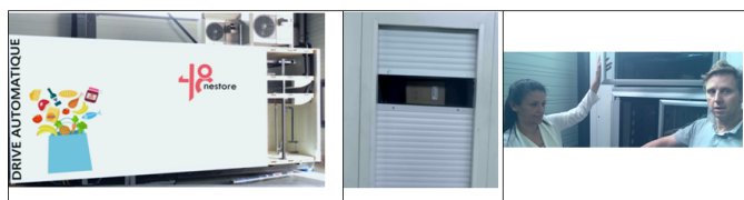
Fig. 1. Box/Lockers for fresh and frozen foods

ByBox [14, 15] is a more directly related proposal, hailing from the Silicon Valley and created in February 2000. The original mission was to build technology to increase the efficiency of online shopping delivery. The first product was an electronic lockerbank connected to the Internet. Today, ByBox continues to lead the global market for locker-based solutions to difficult supply chain problems. Online shopping remains a core market for ByBox with a range of automated Click & Collect solutions. Today, the three pillars of ByBox are software, technology and infrastructure. A ByBox proprietary software platform was designed to re-wire field service supply chains to operate with less inventory and minimal distribution, with the mantra “move the data, not the part”. For field service, the latest product is an app-controlled smart box, which takes the form of temperature controlled units for the grocery market. The ByBox is used in the UK and South Africa.