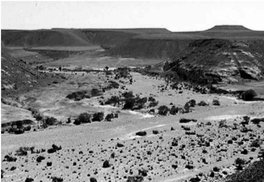
FIGURE 5. An overview of the "Khuzmum" outcrop taken from the north-west.

Therefore, either the RASA Project has failed to col-