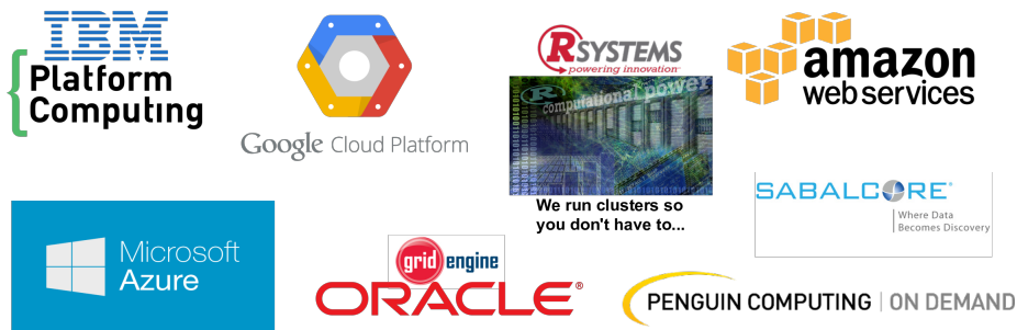
Figure 1: Some outsourced computing services