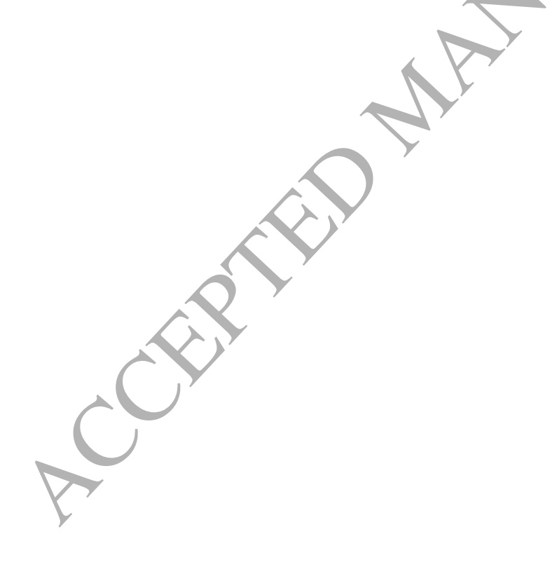
Fig. 1. A summary of the differential variables from Tables 2 - 5 , found for each eating quality cluster (pHu, tenderness, juiciness and beef flavor). A red color key (gradient ruler) on the upper left indicates the level of the effect of clustering on the studied variables for each quality cluster trait.