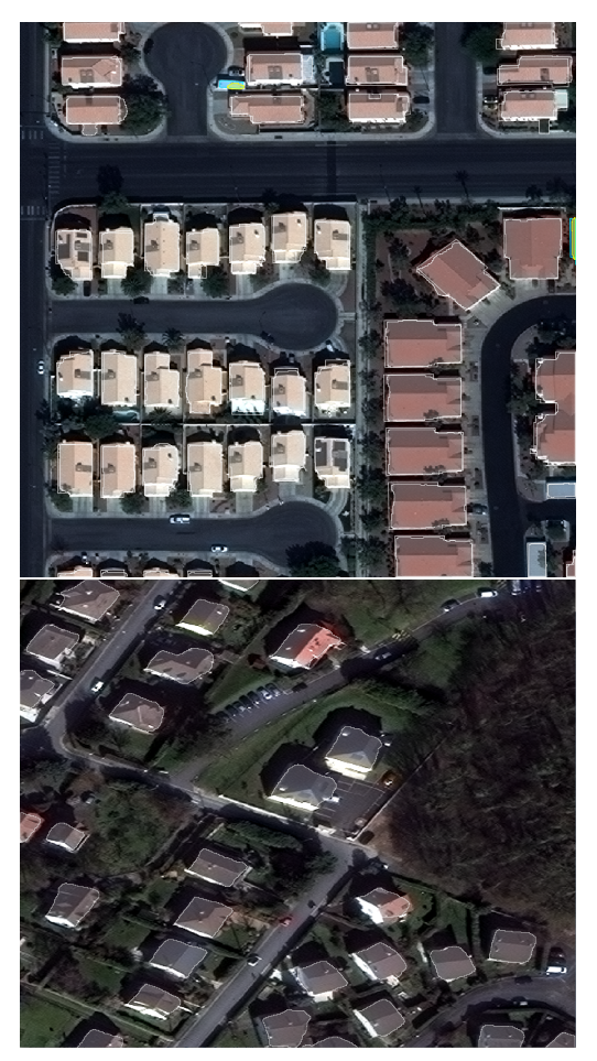
Figure 2. Example of high building density images. We can see that a large majority of the buildings are correctly detected. The few errors come from the smaller buildings, or from small parts of buildings cut at the edges of the image, as well as adjacent buildings being merged into one.

ure 3). When we reduce the model uncertainty around buildings, adjacent buildings are considered as one unique building instead of two different ones. The second one comes from numerous errors in labeled data. Those errors can prevent the models to learn useful features or can punish them when they do. Missing a lot of small buildings will have a huge impact on the F-score, but smaller buildings are not consistenly labeled, especially in Shanghai.