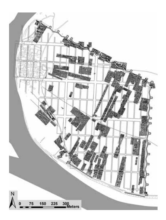
Fig. 3. Example of orthogonal city planning: magnetic map on the site of Apamea on the Euphrates (Turkey) (scale white/black -10/+10 nT/m)

about the spatial organization of the ancient cities. In the Near East, this has touched on two periods representing significant phases of urbanisation of the region: firstly, the Early Bronze Age with the development of circular cities in Northern Syria and at the limits of the arid margins to the west, known as the second urban revolution of the region (Akkermans et al. 2002), and secondly, the Hellenistic period after Alexander's conquest, with the diffusion of an orthogonal city-planning model inspired by the Hippodamian plan, which had appeared in Asia Minor in the 5th century BC (Martin 1974). Impressive results have been obtained on numerous sites like Tell Chuera (Meyer 2010), Tell al-Rawda (Gondet and Castel2004) for the Early Bronze Age or Apamea (Gaborit et al. 1999), Dura-Europos (Benech 2007), Cyrrhus (Abdul Massih et al. 2009), Palmyra (Becker and Fassbinder 2001) concerning the Hellenistic foundations. These geophysical maps have undoubtedly changed the perception of these cities and have helped to contextualise the old excavations in the overall spatial organisation of the urban layout. They have also changed archaeological excavation strategies to locate more precisely forthcoming digging projects designed to confirm and understand what the geophysical maps have revealed.