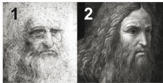
Figure 4 | Result of the first artificial-intelligence test match (Fig. 3), comparing face image [1] to the rest of the database (1:51). On the right, the leading candidate [2] ranked by the NeoFace ® Watch software.

The first test match carried out with artificial-intelligence software compared to the database (1:51) face image [1] of the red-chalk portrait commonly attributed to Leonardo da Vinci (Fig.3). The biometric system tried to answer to the question: ‘Who is represented on the face image [1]?’. This was a ‘one-to-all’ test match (1:51), comparing the signature obtained from the characteristic data input for image [1] with those of the other 51 face images in its database. The system then ranked in descending order all the paired scores obtained by these 51 ‘one to one’ comparisons, (1:1) x 51 (Fig. 3). The first position was occupied by face image [2] of the Apostle Thaddeus painted portrait, whose features are presumed to be those of Leonardo da Vinci (Fig. 3 and 4).