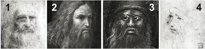
Figure 2 | The four apparently similar faces which were the subject of the present study. 1, Presumed ‘Self-portrait of Leonardo da Vinci’ (Turin - Italy). 2, The Apostle Thaddeus from the ‘Last Supper’ (Luxembourg). 3, Saint-Anthony from the ‘Temptation of Saint Anthony’ (France). 4, Presumed ‘Portrait of Leonardo da Vinci’ (Windsor Castle - UK).

a 85-person panel the subjective assessment of the degree of resemblance between the images of faces we submitted in parallel to the software NeoFace ® Watch . Usually, a visually set score around 0.650 for a pair of ‘real faces’ (photographed) would indicate that the two faces are potentially alike. In our particular case, namely the recognition of ‘interpreted faces’ (drawn or painted) by a nonexpert panel, we also considered a score around 0.450 significant.