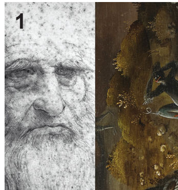
Figure 6 | Anthropomorphic landscape : On the right, the ‘Leonardo-like’ profile of the ‘Temptation of Saint Anthony’, from which is also extracted face image [3] of this study (Fig. 2). On the left, the red-chalk portrait commonly attributed to Leonardo da Vinci [1].

Ultimately, this study was able to affirmatively answer to the original question, namely : ‘Using artificial-intelligence tools, is it possible to measure objectively similarities observed subjectively by human eye between faces in graphic works using different pictorial techniques?’ The consistency of the test-matches results obtained using the NeoFace ® Watch artificial-intelligence software and those obtained using the human ocular and brain neural network can position this software as a necessary tool for facial recognition applied to separate graphic works made of different pictorial techniques. Beyond this scientific aspect, if tried that the red-chalk portrait kept at the Turin Royal Library [1] would be a self-portrait of Leonardo da Vinci, as regards the two ‘unrecognized’ face images [2, 3], this study can allow to affirm that they would also be that of Leonardo da Vinci. Anyway, the results of the present study significantly shows that these two face images would be portraits of the same personality as that shown in the red-chalk portrait kept at the