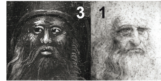
Figure 5 | Result of the third artificial-intelligence test match (Fig. 3), comparing face image [3] to the rest of the database (1:51). On the right, the leading candidate [1] ranked by the NeoFace ® Watch software.

represented Saint-Antony, ‘the Great’ alias ‘the Egyptian’. The system then ranked in descending order all the paired scores obtained by these 51 ‘one to one’ comparisons, (1:1) x 51 (Fig. 3). The first position was logically occupied by face image [1] of the red-chalk portrait commonly attributed to Leonardo da Vinci (Fig. 3 and 5).