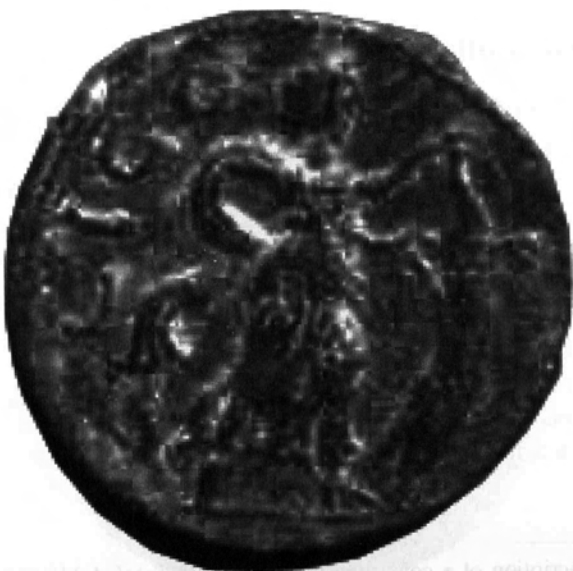
Fig. 9. Aes. Plautilla (London 1920 8-5-1159).