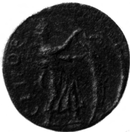
Fig. 8. Aes. Julia Domna (Berlin. Löbbecke 1906).