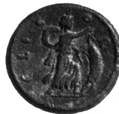
Fig. 2. Aes. Antoninus Pius (Priv. Coll.).

Rev.: CLI COR, view of the harbor of Kenchreai—suggested by a