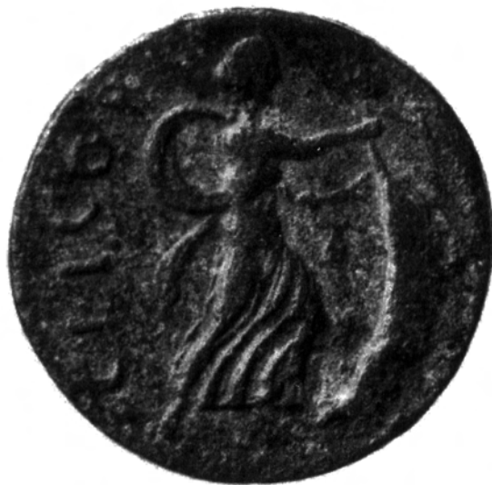
Fig. 5. Aes. Lucius Verus and Marcus Aurelius (Berlin. Imhoof-Blumer 1900).