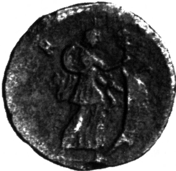
Fig. 7. Aes. Septimius Severus (Priv. Coll.).