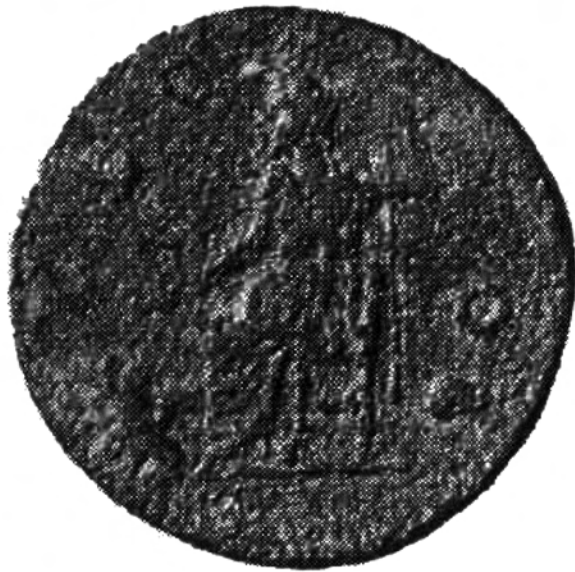
Fig. 6. Aes. Commodus. (Priv. Coll.).