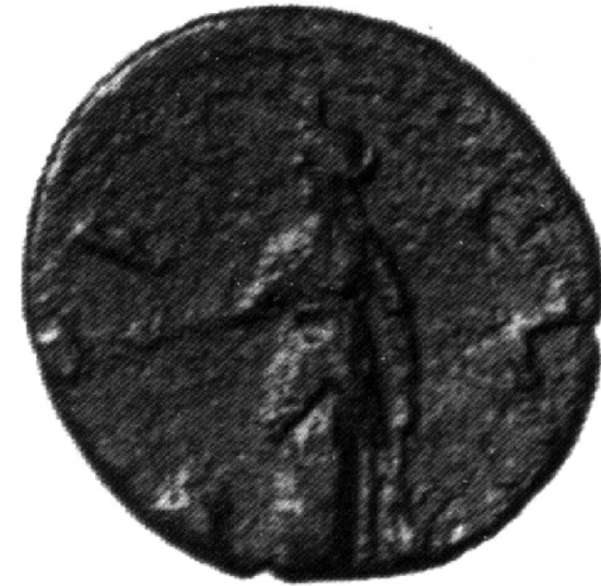
Fig. 4. Aes. Antoninus (Priv. Coll.).

AE, 26 mm, 12.12 g (5 ex.). Axis: 3:00 (1), 10:00 (4) (= SNRIS Corinthus 5)