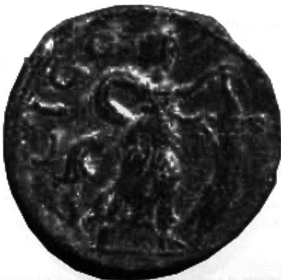
Fig. 9. Aes. Plautilla (London 1920 8-5-1159).